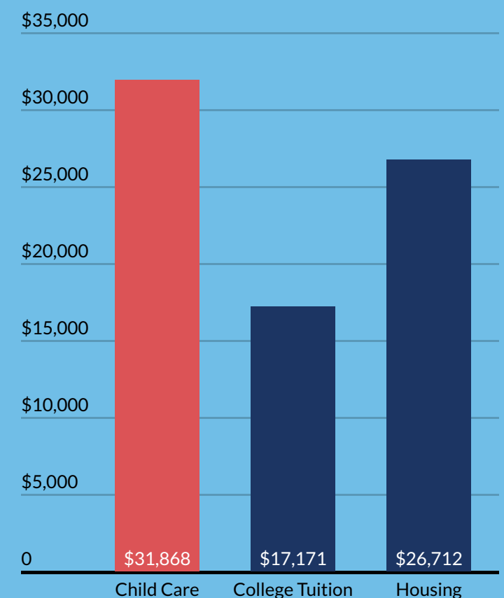
Annual child care price for 2 children (an infant and 4 year old) in a center

When compared to other household expenses, child care often has the highest price.